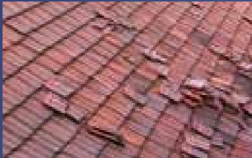
Clay / Concrete Tiles