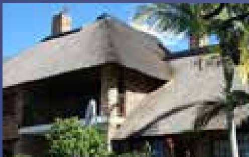
Thatch / Majani