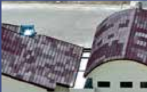
Fake and Copy Stone Coated Metal Roof Tiles